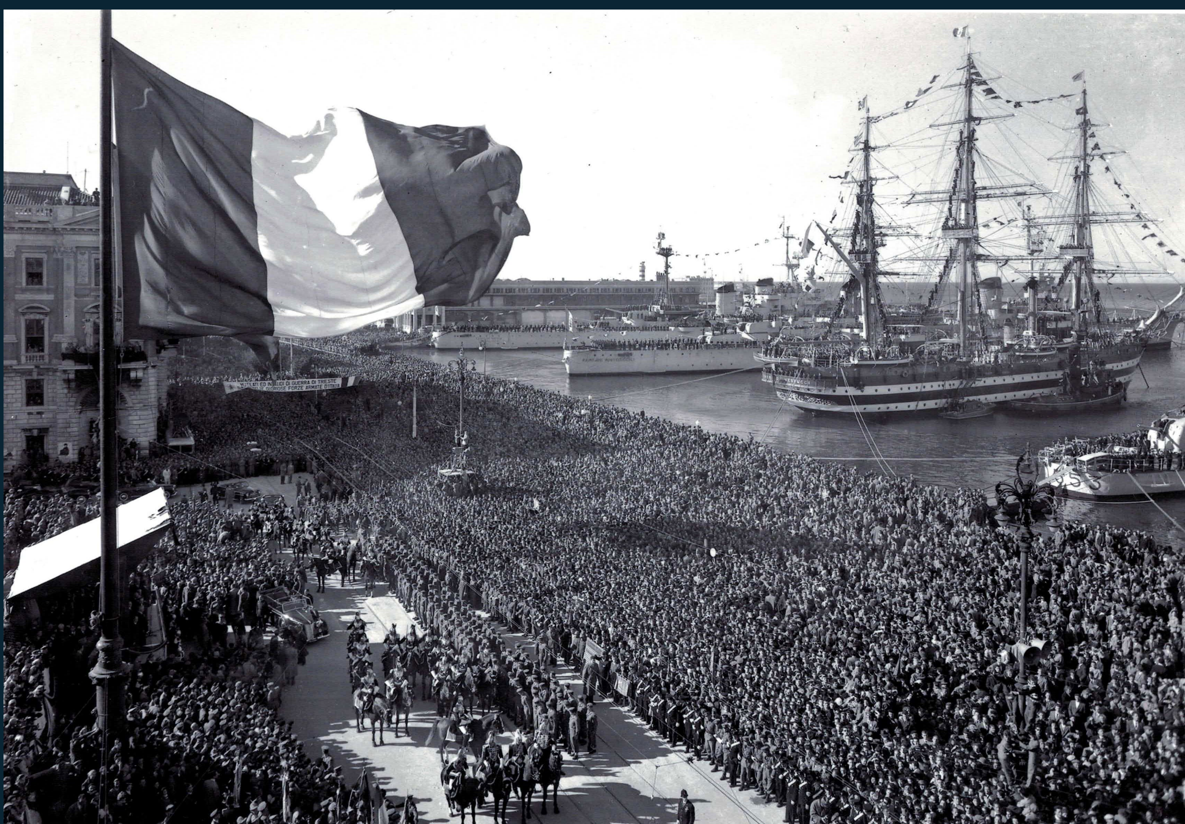
Celebration of the reunification of Trieste with Italy, 1954.