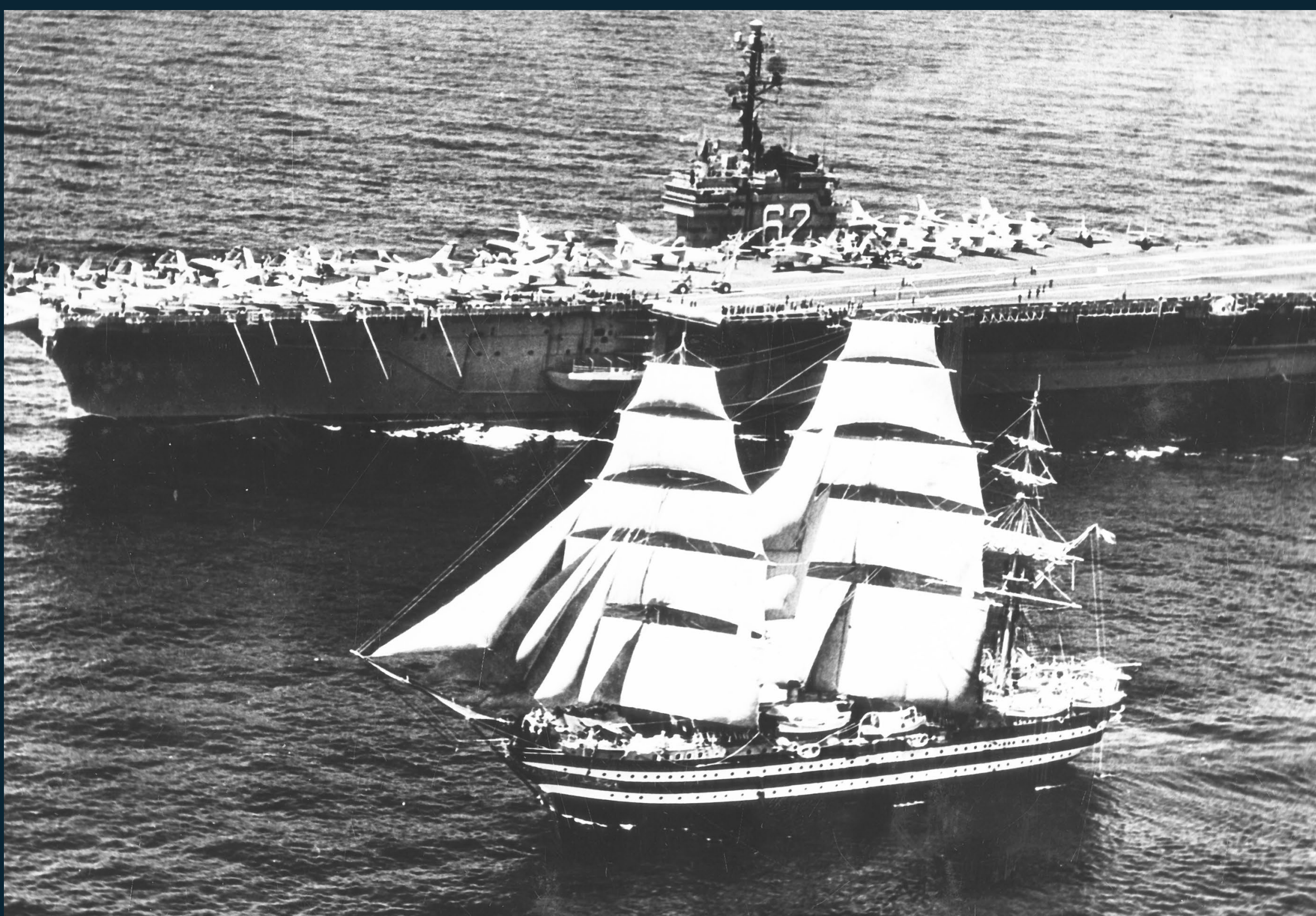
Meeting with USS Independence, 1964.